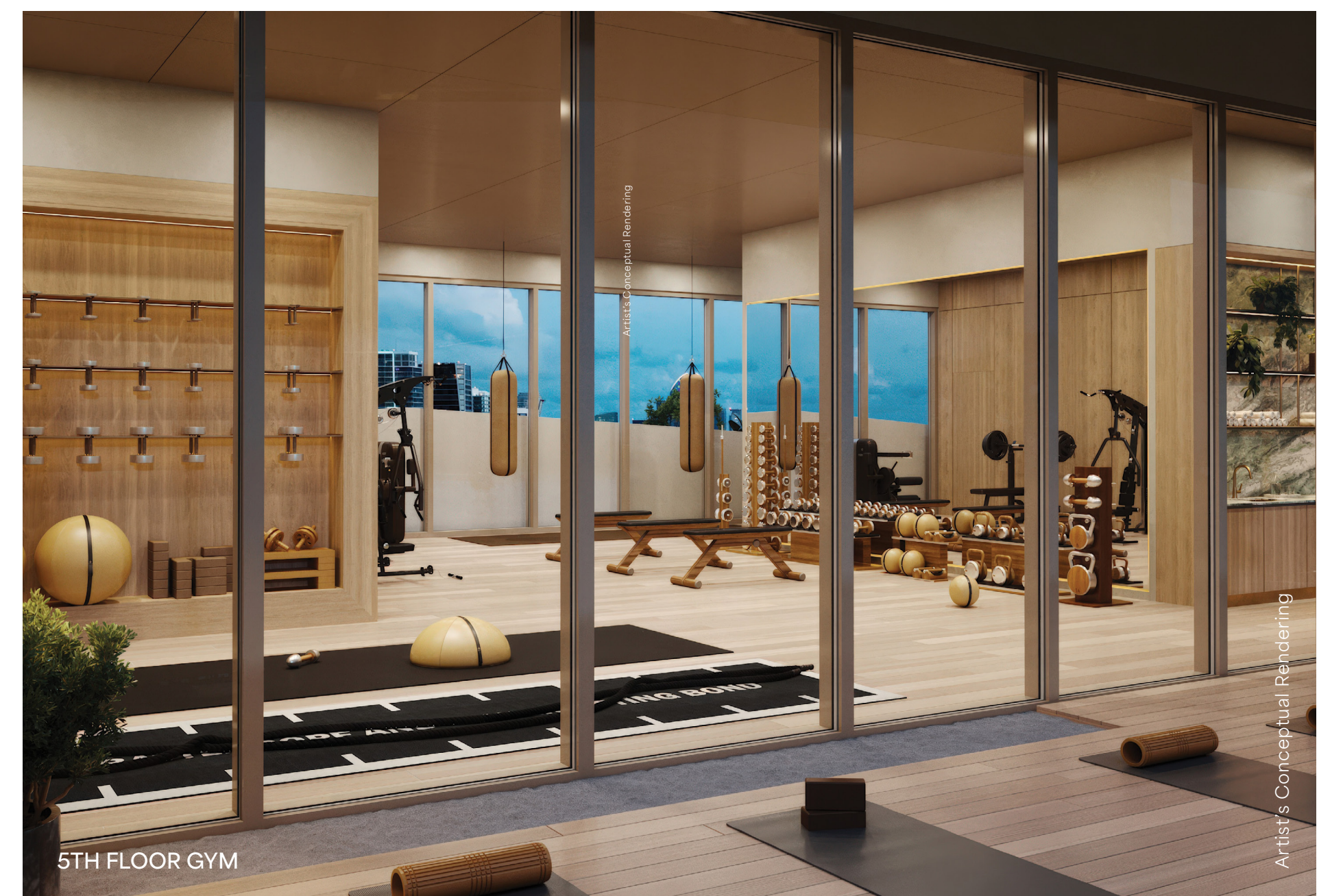
5TH FLOOR GYM